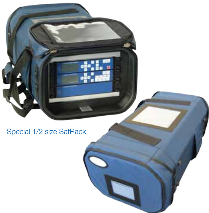
Special 1/2 size SatRack

SatRack has been successfully deployed by leading ENG organisations and the military including BBC, Sky, ABC, CBS News, Vislink, Schlumberger and Qinetiq.