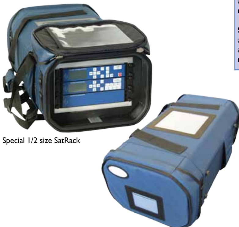
Special 1/2 size SatRack

SatRack has been successfully deployed by leading ENG organisations and the military including BBC, Sky, ABC, CBS News, Vislink, Schlumberger and Qinetiq.